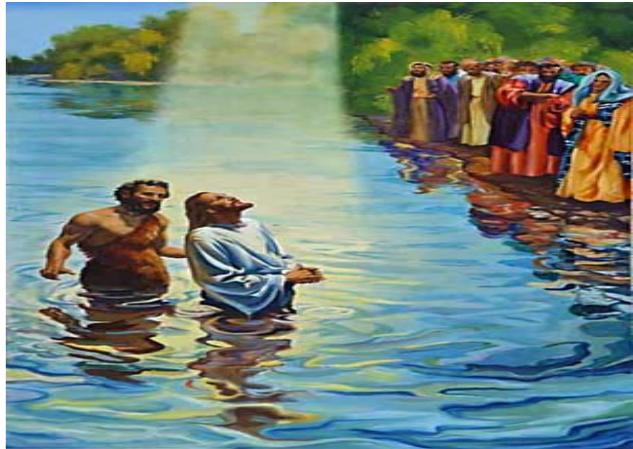
This is My beloved Son, in whom I am well pleased."