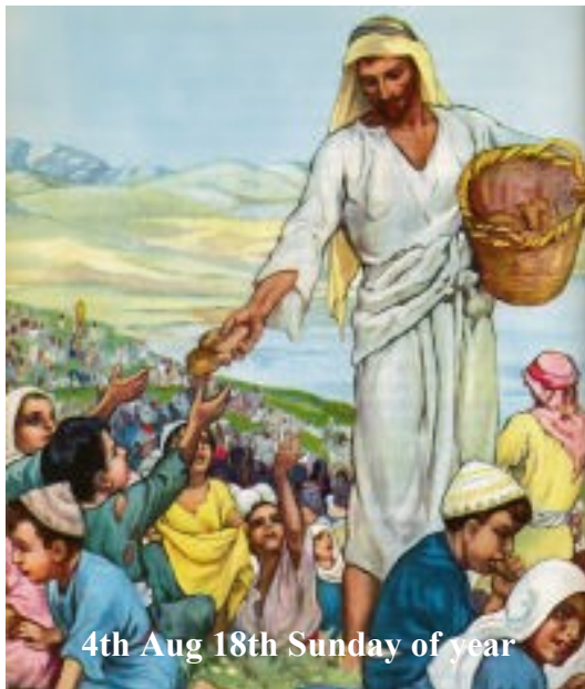
4th Aug 18th Sunday of year

Jesus was doing just that in this reading: preparing a table in the desert, producing plenty, and more than plenty, in the place of utmost scarcity. But how did he do it? St John Chrysostom (c. 349-407 AD) wrote: "Observe the wisdom of the Master; he did not say to them, 'I will give them something to eat,' but, 'you give them something to eat.'" He accepted their meagre contribution, he did not set their gift aside, but used it. Another ancient writer said, "He created no alternative food; he took what they had and gave thanks." He allowed the bounty to appear to come from themselves. The gift of God does not displace us from our lives; it does not take over from us and make our effort redundant. On the contrary, it is in the throes of our efforts that the gift of God appears.